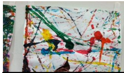
Preschool Marble Painting

As parents and educators, we always strive to find ways to support children's learning and development. With young children a great way to support and develop children's ideas is by asking open ended questions. Open ended questions are questions that require more than a single, concrete answer. For example, if your child is playing with LEGO's and you ask, "Are you building with LEGO's?" they most likely will respond "yes" and from the child's standpoint, the conversation is now over. In contrast to this, open-ended questions support and further children's learning by encouraging them to explain what they are doing and thinking. In the same situation mentioned above, try asking the following questions instead: "Oh, I see you are playing with LEGO's. Tell me about it," or "What would happen if you added this piece?" or "What do you plan to do next?" Try asking open ended questions on outings, while driving, or while playing outside and listen to all of your child's thoughtful responses.